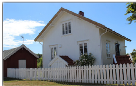
My great-grandfather's house on the island of Herføl

As if the language course and the sightseeing weren't enough, the highlight of my trip had to be meeting my Norwegian relatives for the first time. The only information I had about my relatives was three names and mailing addresses, which I received several days before I left Alaska. So I mailed three letters as soon as I got to Norway and hoped for the best. Imagine my surprise to get emails from all three families just a few days later, with invitations to come stay with them for a weekend. Luckily, everyone's schedules worked out, and I was