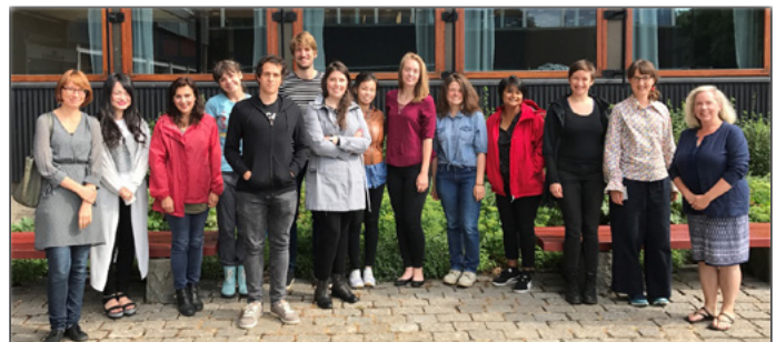
Final day of class