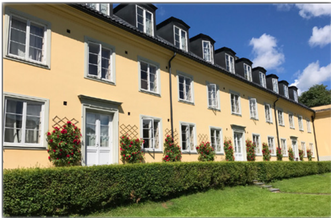
Blindern Studenterhjem, my home for 6 weeks.

As many of you know, this was my first trip to Norway, and I was very excited. Although I've been participating in the language courses at Bernt Balchen Lodge for the past five years, and I've learned a lot, I was ready to take my language skills to the next level. I enrolled in the Intensive Intermediate Norwegian course at the University of Oslo's International Summer School (ISS). The thought of spending three hours a day immersed in learning Norwegian for six weeks was my idea of heaven.