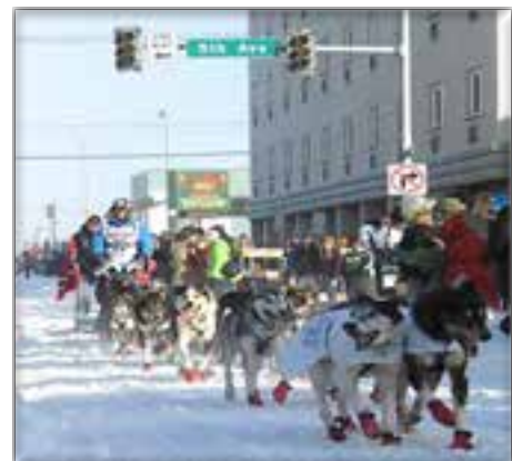
Robert Sørlie 21st Place & 2 time Iditarod Champion